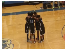
Gateway vs. McKinley

After a strong start of the season, the girl’s varsity basketball team has come back from some difficult losses and is looking forward to working together as a team and finishing the season strong.