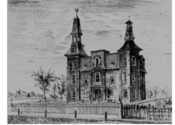
Drawing of Sumner High school in 1875