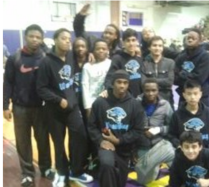
Gateway wrestling team '14-'15. Courtesy of Coach